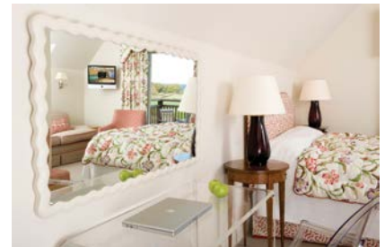
Square [i] running on Apple iMacs at Park House Hotel, Sussex, UK